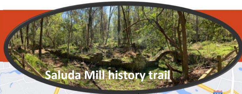
Saluda Mill history trail