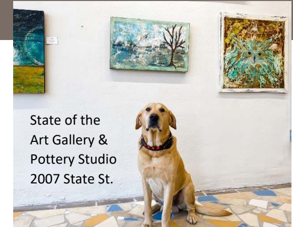
State of the Art Gallery & Pottery Studio 2007 State St.

Bonus: Take a selfie and tag us at #GreaterCWC